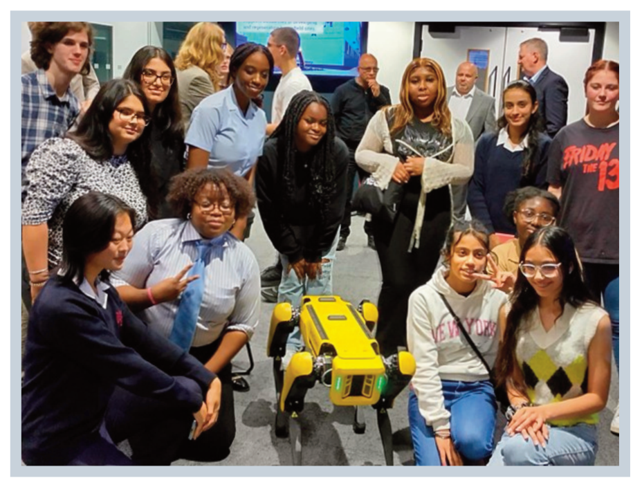
Youth Council at the Invest Board with robot dog

The Youth Council were also involved in the plans for the Open Spaces for the new Canalside development and have been involved in the discussions regarding the learning quarter. Members of the group also contributed to discussions regarding the plans for the redevelopment of an area of Bilston Market.