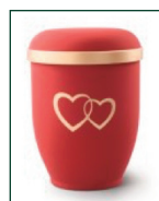
Red Heart £95.00