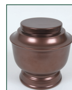
Bronze £67.00 (single)