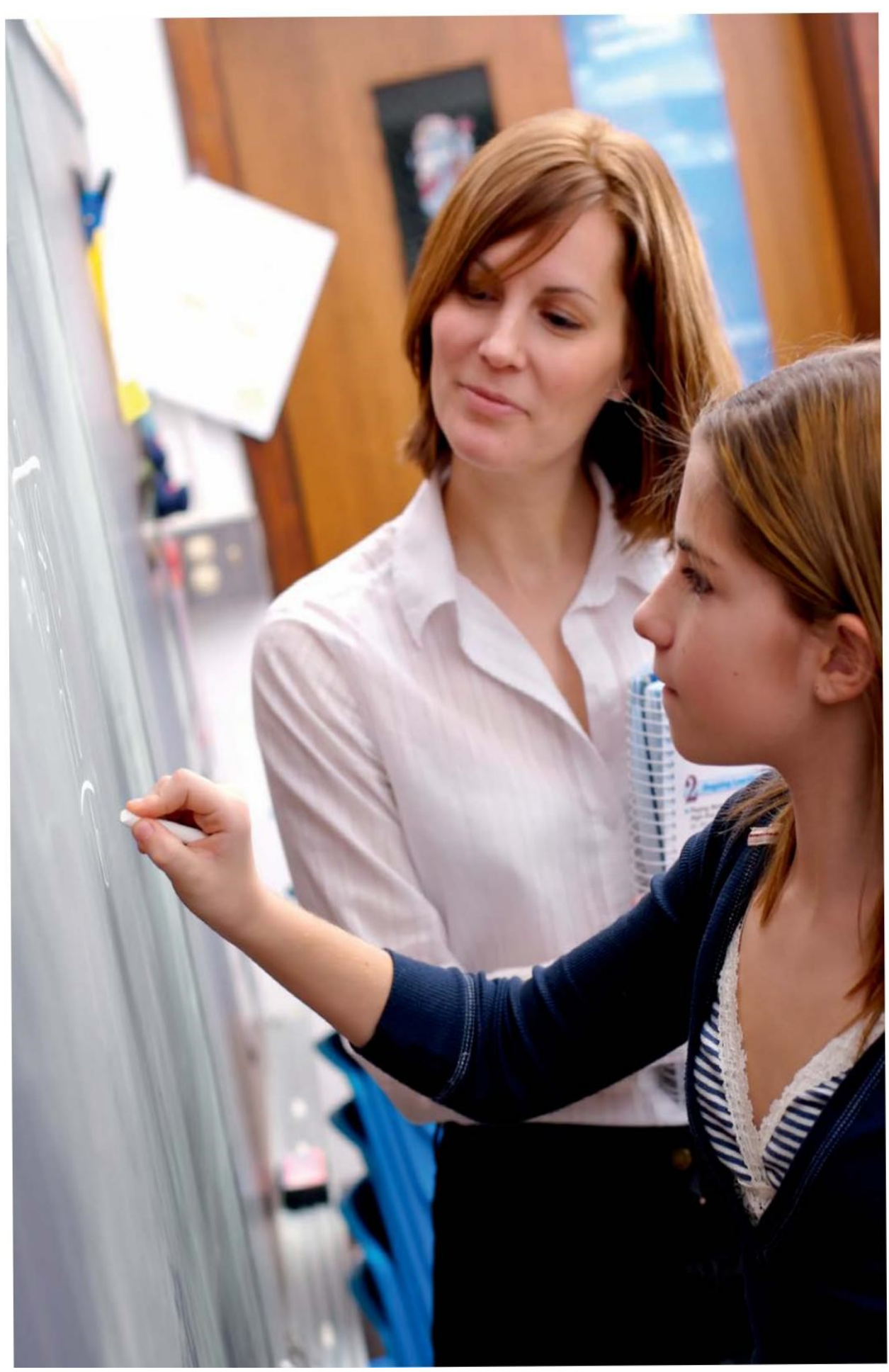
14 City of Wolverhampton Council