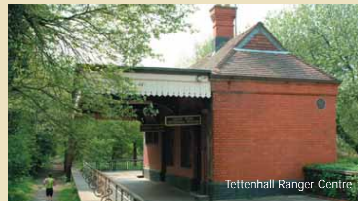
Tettenhall Ranger Centre

about Smestow Valley L.N.R. and facilities available phone Tettenhall Ranger Centre on 01902 552351 City Direct on 01902 551155 Tourist Information Centre 01902 556110 www.wolverhampton.gov.uk/smestow